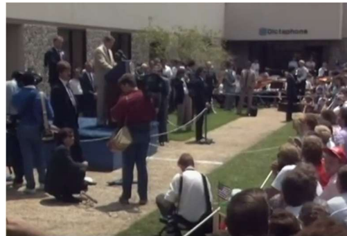
President Reagan at the Melbourne Auditorium.

The auditorium most likely hosted other events for Melbourne residents. The auditorium was a short-lived structure, probably being demolished by the mid-1910s. In 1927, the Wells donated 30 acres of land (including the portion of land where the auditorium sat) to the City of Melbourne to maintain it as a park. In 1964, a new, larger auditorium was constructed, relatively close to where the original one was located. [3] In 1987, President Reagan visited Melbourne and gave a speech at the auditorium. [4] Today, the Melbourne Auditorium boasts over 20,000 square feet of entertainment space, including a main hall, two wing halls, a stage, and a large lobby area. [5] The auditorium is used for a variety of events, from performances to expos to even fruit tree sales on the south lawn.